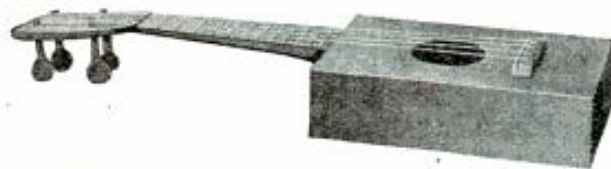
This Cigar-Box Ukulele Cost the Maker 30 Cents, and Affords Him the Pleasures of a More Expensive One

T HE one-string banjo, the cigar-box guitar, and similar vaudeville favorites are giving way to the tantalizing ukulele, and the home mechanic, to be up to date in his musical craftsmanship, must fall in line. The size of this instrument makes it especially suited to the cigar-box type of body construction, as detailed in the several